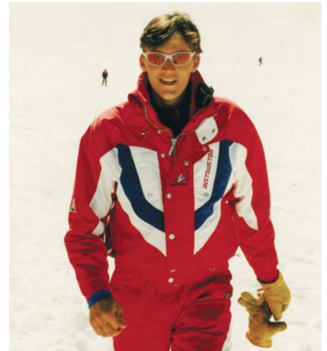
The uniform in the early 2000's.

Cheers, Nyree Fiddes www.idreamofsnow.com