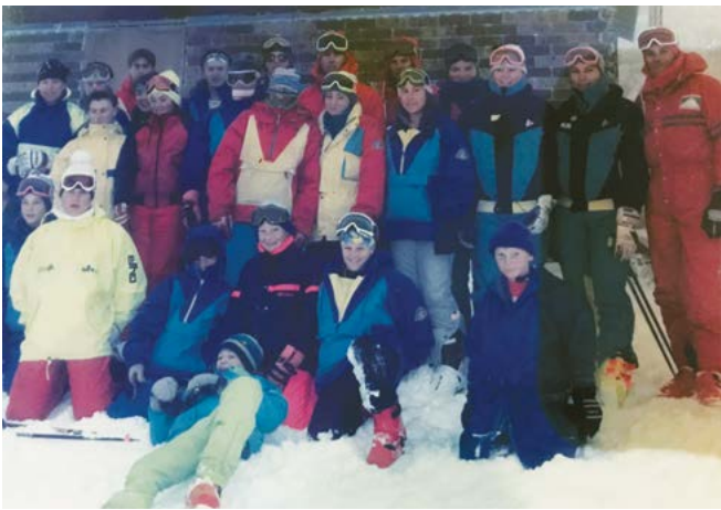
Ski Instructors uniform circa the 80's.

Ah, the clothing that is and was the Falls Creek instructor's uniform. It's changed quite a bit over the years. We've had many iterations, many brands, many colours and varying levels of waterproofness of this uniform over the years. I've loved the style of many of Falls' instructors' liveries, loathed one or two and kicked off a passion for collecting snow-wear that currently numbers in the 100's