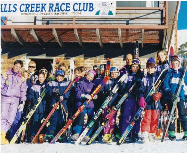
The flash Nevica suit in the 90's.