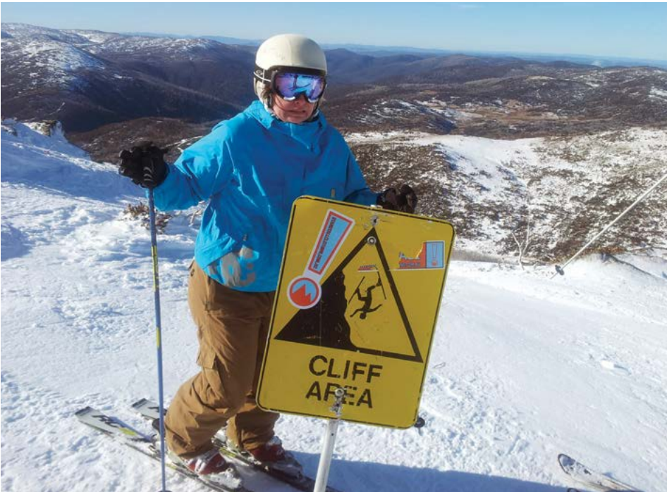
Don't push yourself off a cliff, but push yourself to improve.

Fear, fitness and time on skis might be obvious causes for a learning plateau, but what if it's something else? Look no further than your equipment. This is not a cop out. Sometimes, you can blame your equipment. If you're getting consistent feedback from