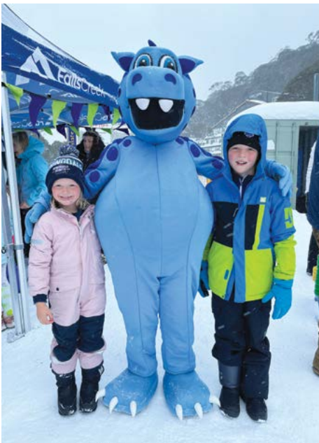
Bring the kids to the Village Bowl on Tuesday afternoons from around 3:30 for a ton of fun!

Every week we get to celebrate the snow season with Twilight Tuesdays up in the Village Bowl. Enjoy roasting marshmallows over our fire pits – fight over the pink ones with you littlest family members and see how they light up when you give it back to them. Challenge your kids to a mega-size game of Connect 4, or hurl the Finska, or Kubb (which is like Finska, only better). You don’t need kids to join in the fun, everyone is welcome. Come and boogie to