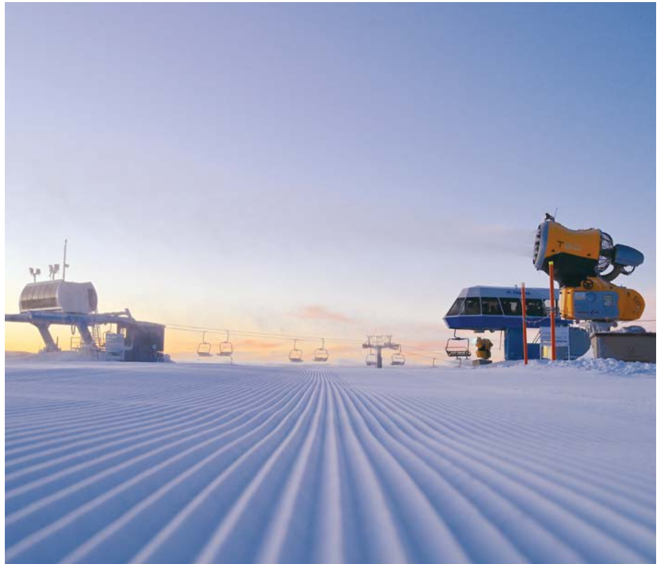
Incredible grooming has been a feature of this early opening – set to make your next visit an absolute pleasure.