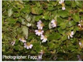
Ivy Goodenia Goodenia hederacea