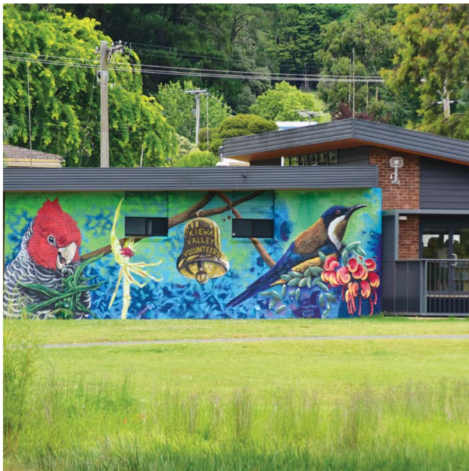
Facing the Pondage walking track on the western side of the Library building this mural is certain to be appreciated by many.