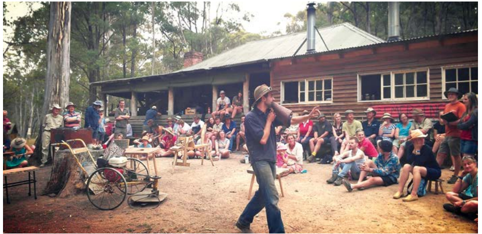
The fabulous Mittagundi Festival and Open Day has always drawn a crowd – and now is your opportunity.

The weekend was planned to start with the Bush Dance at the Glen Wills hall on Friday 14th January but this has been cancelled – (because of COVID-19