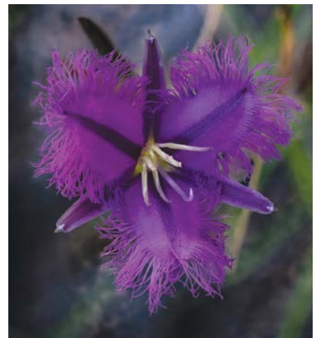
Top: The MTB de Femme was enjoyed by many and is now returning to Falls Creek in March to benefit even more keen riders. Orchids - Left: Rosy Hyacinth Orchid - Dipodium roseum | Centre: Lobelia dentate | Right: Fringe Lily - Thysanotus tuberosus. All fabulous local orchid shots from in and around the Survey Track from the last week in December.